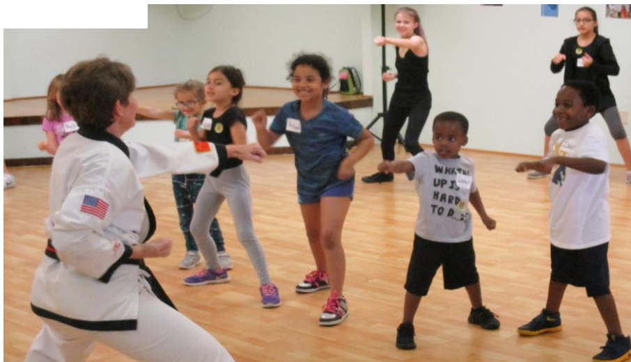
KIDS SELF DEFENSE CLASS IN ACTION with STUDIO JEAR