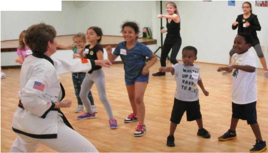
KIDS SELF DEFENSE CLASS IN ACTION with STUDIO JEAR